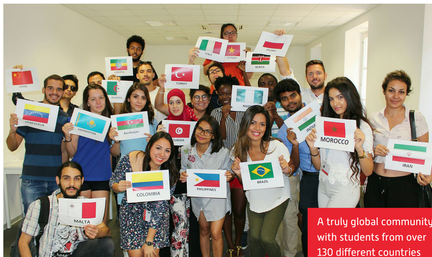
A truly global community with students from over 130 different countries