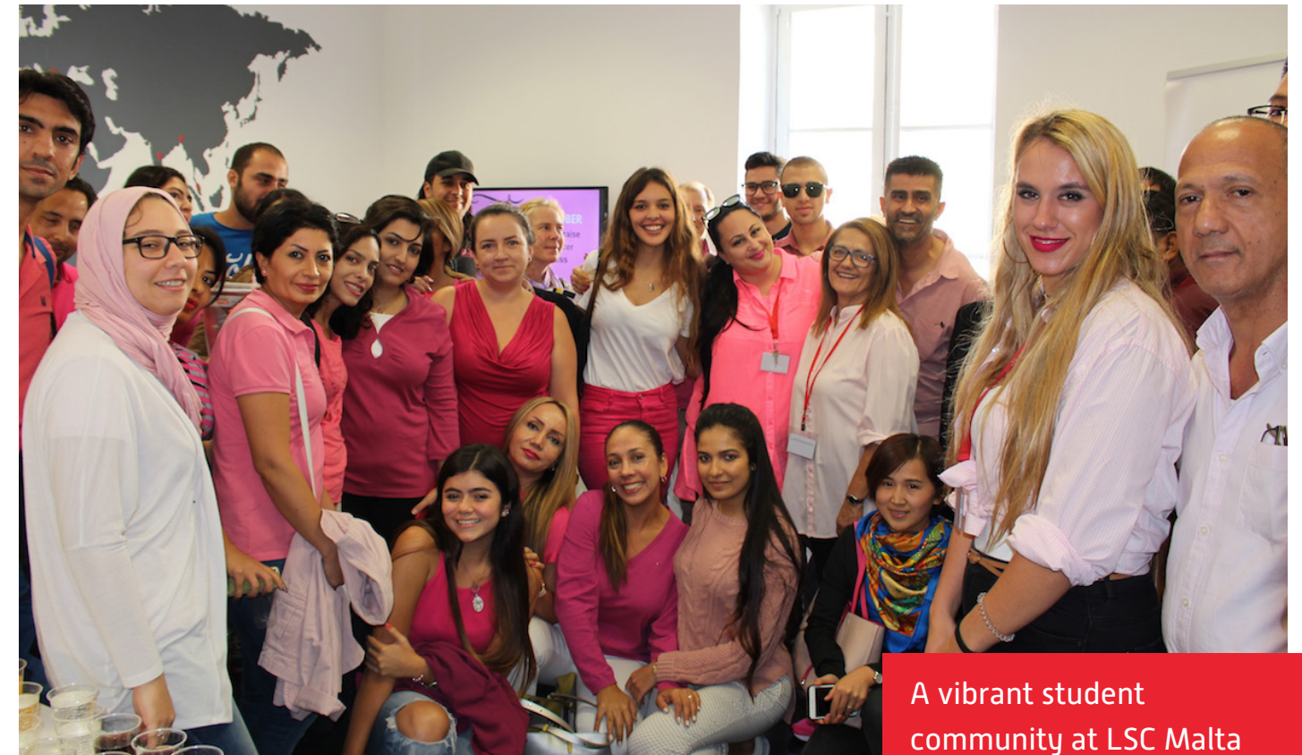
A vibrant student community at LSC Malta