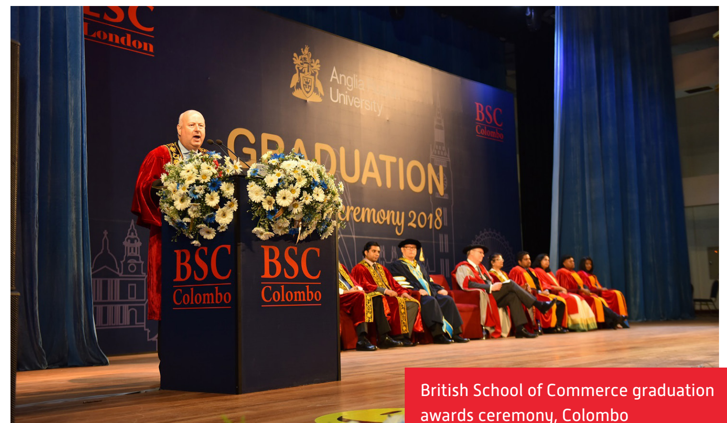
British School of Commerce graduation awards ceremony, Colombo