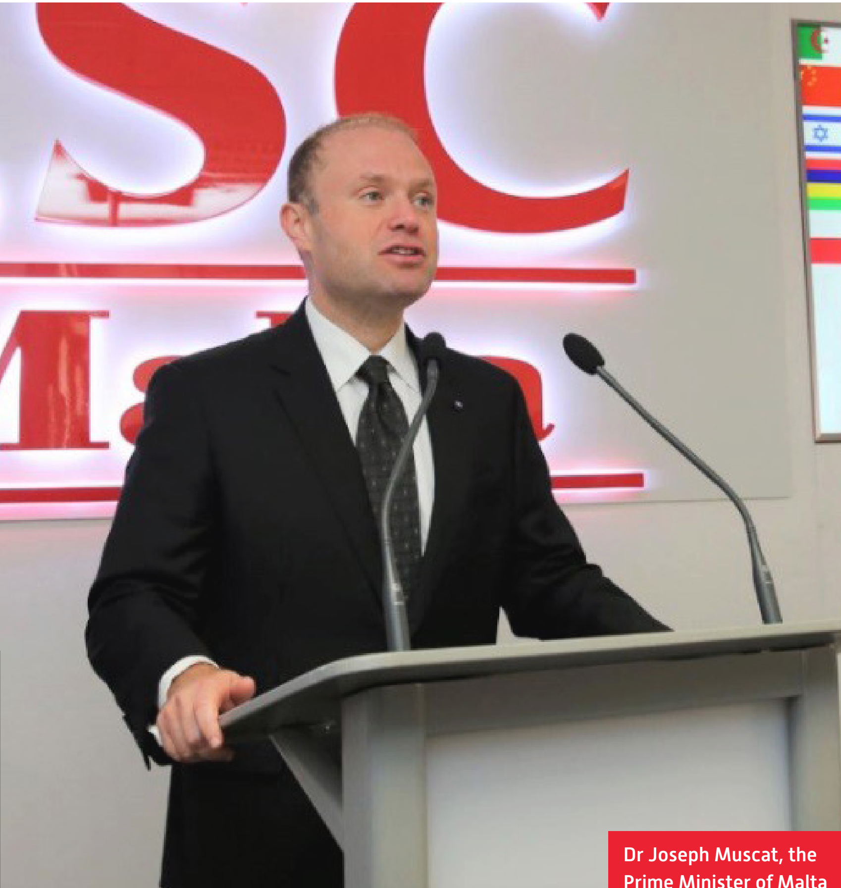
Dr Joseph Muscat, the Prime Minister of Malta