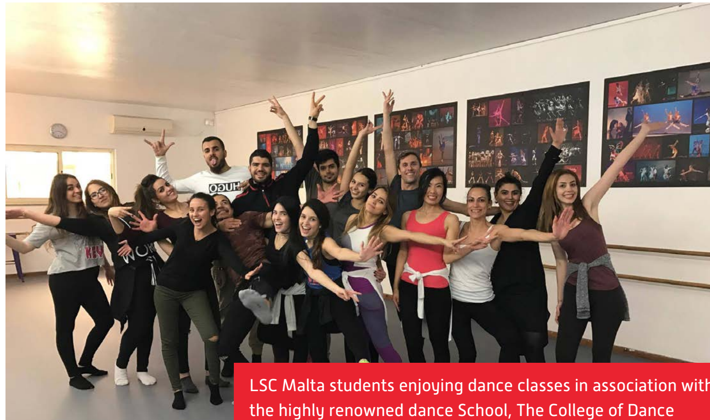
LSC Malta students enjoying dance classes in association with the highly renowned dance School, The College of Dance